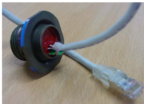
RJF TV 7SA2 G 05 100BTX