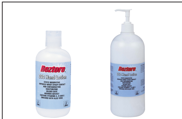
Figure 1. Reztore™ ESD Hand Lotion.