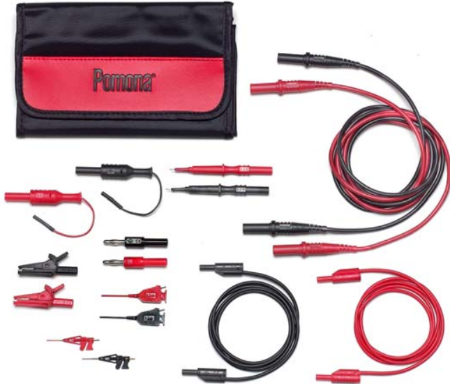
Model 72928 SMD Multi-Use Test Kit

Everything you need for SMD Test with your DMM in one kit