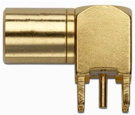
Model 72997 SMB PLUG R/A PCB RECEPTACLE