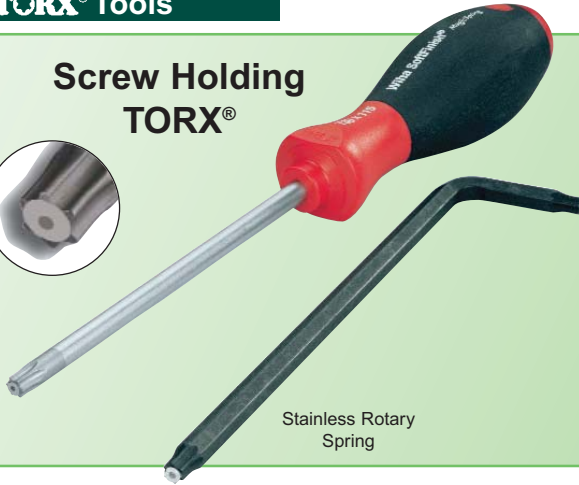
Stainless Rotary Spring