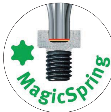
Screw Holding TORX® Tools