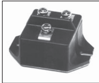
CN24__50, CD24__50, CC24__50 Fast Recovery Dual Diode Modules 50 Amperes/600-1200 Volts