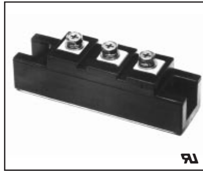
CD410860 Dual Diode POW-R-BLOK™ Modules 60 Amperes/800 Volts