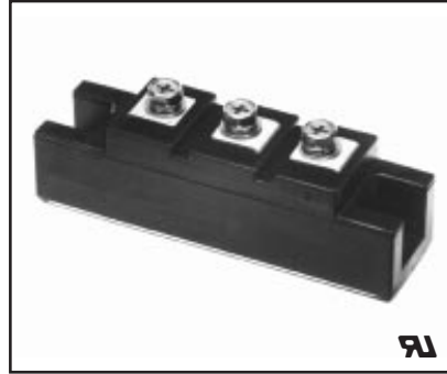
CD411260, CD411660 Dual Diode POW-R-BLOK™ Modules 60 Amperes/1200-1600 Volts