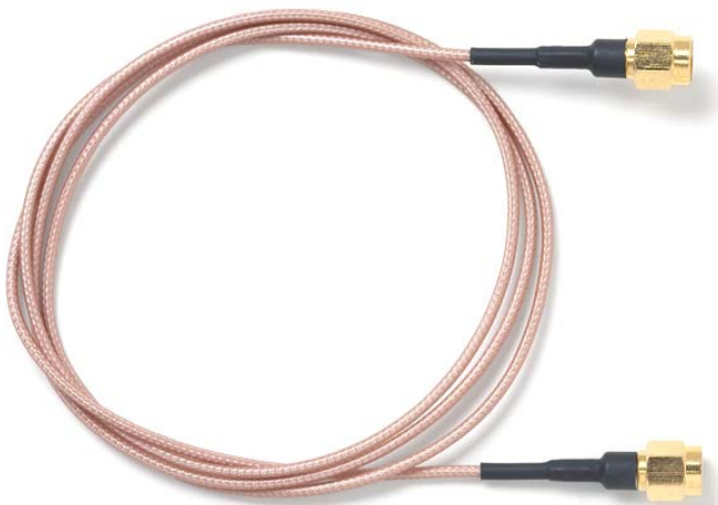
Model 4846-UU SMA Plug to SMA Plug, RG178B/U

Small size, and durability for confident connections