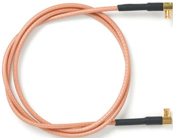
Model 73068 MCX Right-Angle Plug to MCX Right-Angle Plug, RG316/U

Snap-on coupling and miniature size for fast connect and disconnect where space is limited