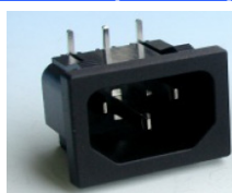
"F" = IEC320 C14 Grounded