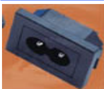
"N" = IEC320 C8 Ungrounded