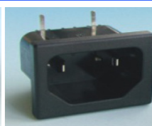
"Q" = IEC320 C18 Ungrounded