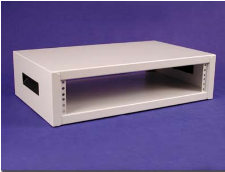
Light Gray (Textured)