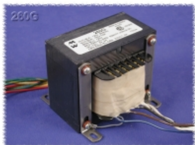
Plate & Filament 260 Series Universal Primary & 50/60 Hz. Operation