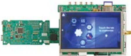
QNX® Software Systems Neutrino® RTOS and Aviage® Middleware Suite on the MCIMX35LPDK