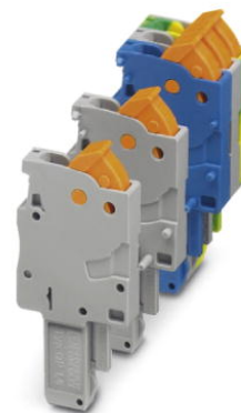
Illustration shows various versions of the product (left, center and right element) in different color combinations

http://eshop.phoenixcontact.de/phoenix/treeViewClick.do?UID=3051072