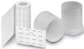
The figure shows the EML (20X8)R product variant

Label, Roll, white, Unlabeled, Can be labeled with: Thermomark R, Thermomark X, Thermomark S, Mounting type: Adhesive, Lettering field: 25.4 x 12.7 mm