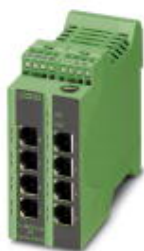
Ethernet Lean Managed Switch with eight 10/100 Mbps RJ45 ports

Please be informed that the data shown in this PDF Document is generated from our Online Catalog. Please find the complete data in the user's documentation. Our General Terms of Use for Downloads are valid ( http://download.phoenixcontact.com )