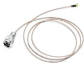
Adapter cable, pigtail 120 cm 90° MCX(m) -> N(m)

Please be informed that the data shown in this PDF Document is generated from our Online Catalog. Please find the complete data in the user's documentation. Our General Terms of Use for Downloads are valid ( http://download.phoenixcontact.com )