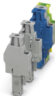
Illustration shows various versions of the product (left, center and right element) in different color combinations

http://eshop.phoenixcontact.de/phoenix/treeViewClick.do?UID=3045716