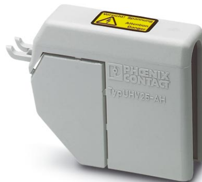
Illustration shows the product version UHV 25-AH

http://eshop.phoenixcontact.de/phoenix/treeViewClick.do?UID=2130444