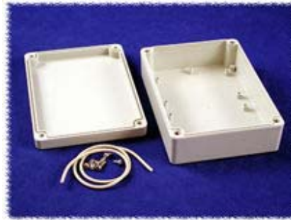
click to enlarge (Open View)