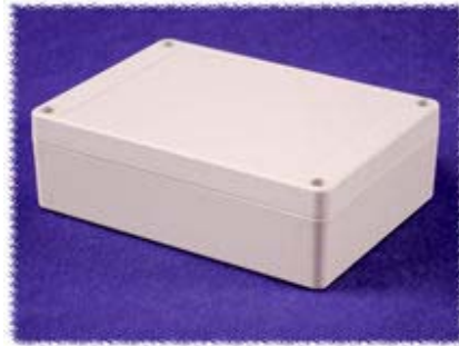
click to enlarge (Assembled View)

Path: Home > Enclosure Index > MORE Enclosures > RITEC - Watertight Polycarbonate