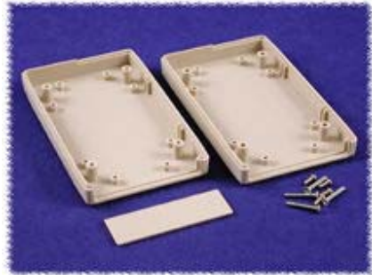
click to enlarge