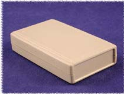
click to enlarge

Path: Home > Enclosure Index > MOREnclosures > RITEC - ABS Plastic - Hand Held