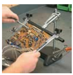
Click on any of the above images to find out more about the products pictured.

Webiste and content, copyright PanaVise Products, Inc. 1996 - 2011. PanaVise, PanaPress, PV Jr, Posi-Stop, Slimline, Slimline 2000, Uniflex, Stay-Put, PortaGrip, PortaGrip 2000, InDash, WindowGrip, Deluxe Multi Media Mount, Clip Caddy, and Vise Buddy are registered trademarks or trademarks or PanaVise Products, Inc. in the U.S. and in other countries. PanaVise's products are protected under one or more of the following U.S. Patents: 2,888,088; 3,661,376; 5,118,058; 5,187,744; 5,465,932; D390,849: D582,884. Patents pending on additional products in the U.S. and in other countries. PanaVise has a long history of vigorously prosecuting violations and/or protecting both its physical and intellectual property rights. All PanaVise Products are covered by a Limited Lifetime Warranty