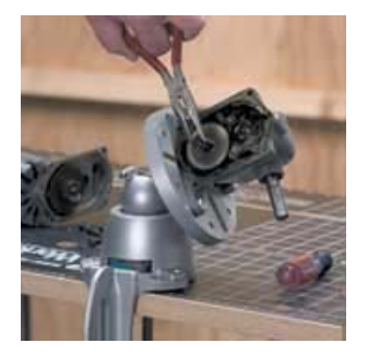
Click on any of the above images to find out more about the products pictured.

Model: 120340B 40 lb. Wall Mount (Black)