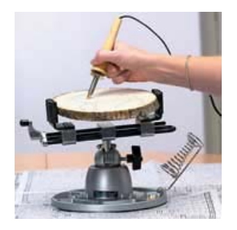
Click on any of the above images to find out more about the products pictured.