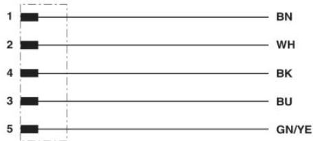
Contact assignment of the M12 plug