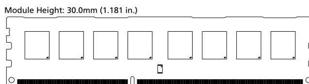
Figure 1: 240-Pin UDIMM (MO-269 R/C B)