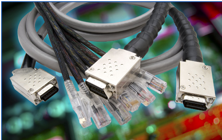
MRJ21 cable assemblies showing connector options: MRJ21 180 degree straight and 45 degree angle connectors as well as multiple RJ45 connectors.