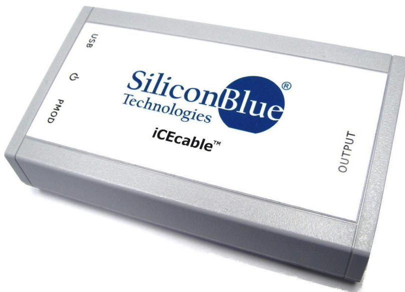
Figure 1: iCEcableM100-01