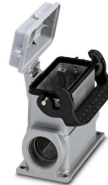
Photo shows product without screw connection

http://eshop.phoenixcontact.de/phoenix/treeViewClick.do?UID=1771176