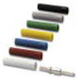
Insulating sleeve, Color: red