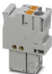
Plug, 2-pos. with integrated, automatic short circuit function

Please be informed that the data shown in this PDF Document is generated from our Online Catalog. Please find the complete data in the user's documentation. Our General Terms of Use for Downloads are valid ( http://download.phoenixcontact.com )