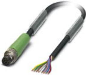
Sensor/Actuator cable, 8-position, PUR, Black RAL 9005, Plug straight M8, on Free cable end, Cable length: 3 m

Please be informed that the data shown in this PDF Document is generated from our Online Catalog. Please find the complete data in the user's documentation. Our General Terms of Use for Downloads are valid ( http://download.phoenixcontact.com )