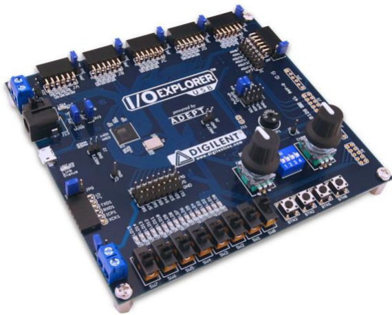
The I/O Explorer board.

The Digilent I/O Explorer USB is a USB peripheral device that allows programmatic access from a personal computer to various external Input/Output (I/O) devices.