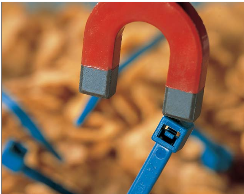
The MCT with metal content.

The Metal Content Tie is a cable tie specifically designed for use in the food & pharmaceutical processing industries. A unique manufacturing process, involving the inclusion of a metallic pigment, enables even small 'cut-off' sections of the tie to be detected by standard metal detecting equipment. Ideally suited for the installation of cabling in and around the manufacturing process.