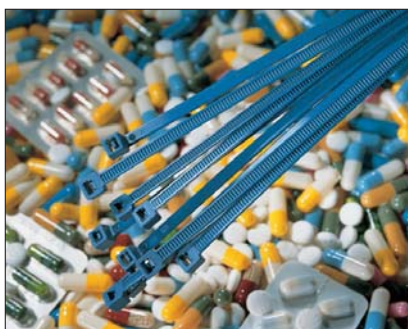
A safe and contamination free production process with MCT.