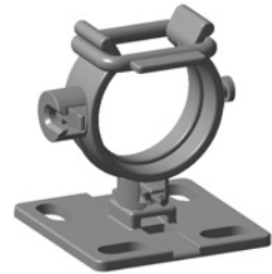
For secure hold, R1 loop can be used (for HWClip25 and HWClip30 only).