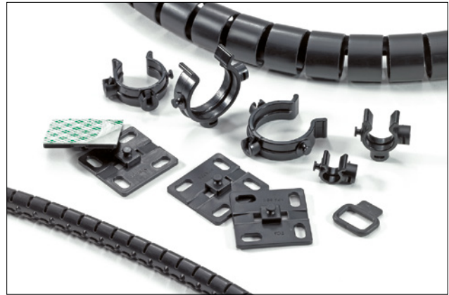
The Helawrap accessory set for bundling, fixing and protecting multiple cable runs.