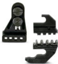
Replacement die, for CRIMPFOX-MT

Please be informed that the data shown in this PDF Document is generated from our Online Catalog. Please find the complete data in the user's documentation. Our General Terms of Use for Downloads are valid ( http://download.phoenixcontact.com )