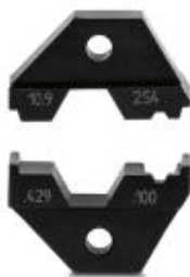
Spare die for CRIMPFOX-CX 10,90

Please be informed that the data shown in this PDF Document is generated from our Online Catalog. Please find the complete data in the user's documentation. Our General Terms of Use for Downloads are valid ( http://download.phoenixcontact.com )