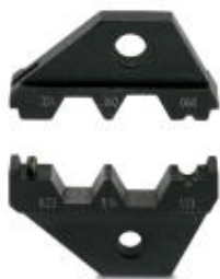
Spare die for CRIMPFOX-CX 9,14

Please be informed that the data shown in this PDF Document is generated from our Online Catalog. Please find the complete data in the user's documentation. Our General Terms of Use for Downloads are valid ( http://download.phoenixcontact.com )