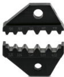
Spare die for CRIMPFOX-FO 5,41

Please be informed that the data shown in this PDF Document is generated from our Online Catalog. Please find the complete data in the user's documentation. Our General Terms of Use for Downloads are valid ( http://download.phoenixcontact.com )