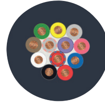
Cable cross section

Pin assignment M12, 12-pos., female side view