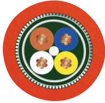
Sercos III [93K]