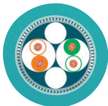
PUR ETHERNET 2x2 FLEX [93E]