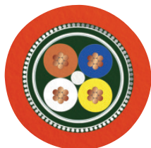
Sercos III [93K]