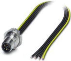
Sensor/actuator flush-type plug, 4-pos., rear/screw mounting with M16 thread, with 0.5 m PP litz wire, 4 x 1.5 mm 2

Please be informed that the data shown in this PDF Document is generated from our Online Catalog. Please find the complete data in the user's documentation. Our General Terms of Use for Downloads are valid ( http://download.phoenixcontact.com )