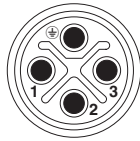
Connector pin assignment of M12 plug, 4-pos., S-coded, view of pin side