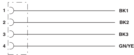
Contact assignment of the M12 socket