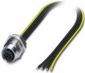
Sensor/actuator flush-type plug, 4-pos., rear/screw mounting with M16 thread, with 0.5 m PP litz wire, 4 x 1.5 mm 2

Please be informed that the data shown in this PDF Document is generated from our Online Catalog. Please find the complete data in the user's documentation. Our General Terms of Use for Downloads are valid ( http://download.phoenixcontact.com )