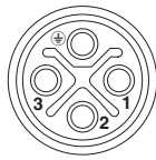
Connector pin assignment of M12 socket, 4-pos., S-coded, view of socket side