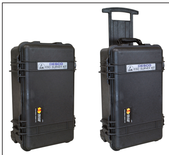
Figure 3. Extendable handle on the carrying case