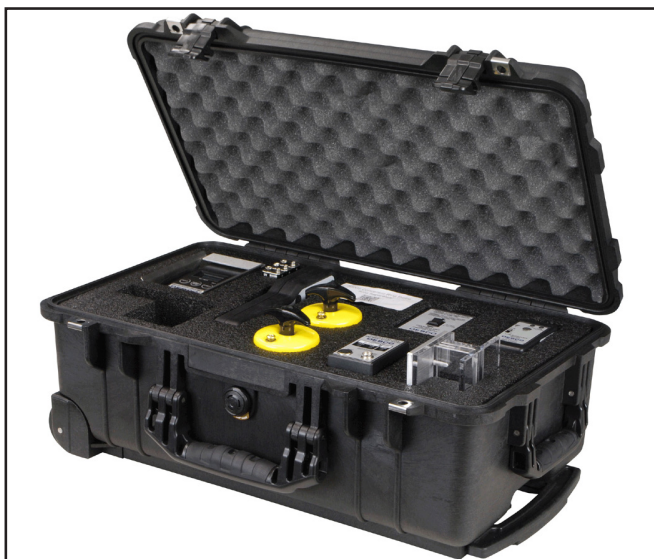
Figure 2. Desco 50569 ESD Survey Kit, Asia, 220VAC