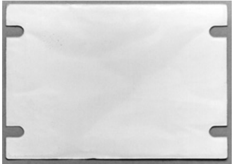
HSP3 Series: Three Phase GN0 and GN3

HSP1 for Single Phase Relay. HSP3 for 3 phase GN0 Series and GN3 Series. Sold in multiples of 25 (1 package) per part number.