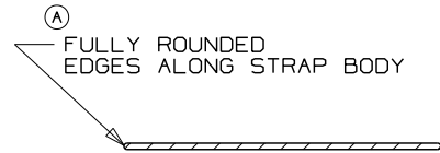
SECTION A - A SCALE: 4x