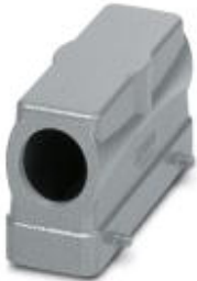
HEAVYCON B24 sleeve housing, for double locking latch, height: 65 mm, with 1 x M25 thread, lateral cable outlet

Please be informed that the data shown in this PDF Document is generated from our Online Catalog. Please find the complete data in the user's documentation. Our General Terms of Use for Downloads are valid ( http://phoenixcontact.com/download )