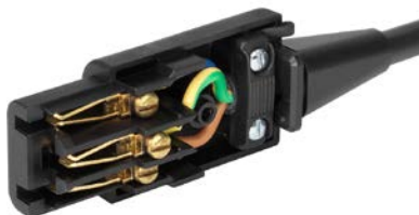
Example with assembled cable